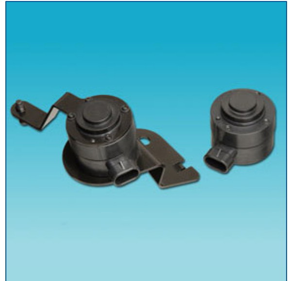
Delphi Non-Contact Rotary Position Sensor (Also shown with optional bracket and arm link.)

The Delphi Non-Contact Rotary Position Sensor was designed to perform in the most demanding automotive environments, including rocks, mud, salt, ice and snow. It is used in the underside of the world's hardest working trucks.