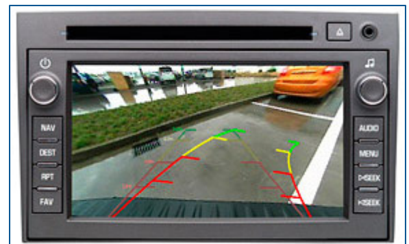
The Delphi Parking Guidance System superimposes guidelines on the vehicle display and provides auditory, step-by-step instructions to the driver.