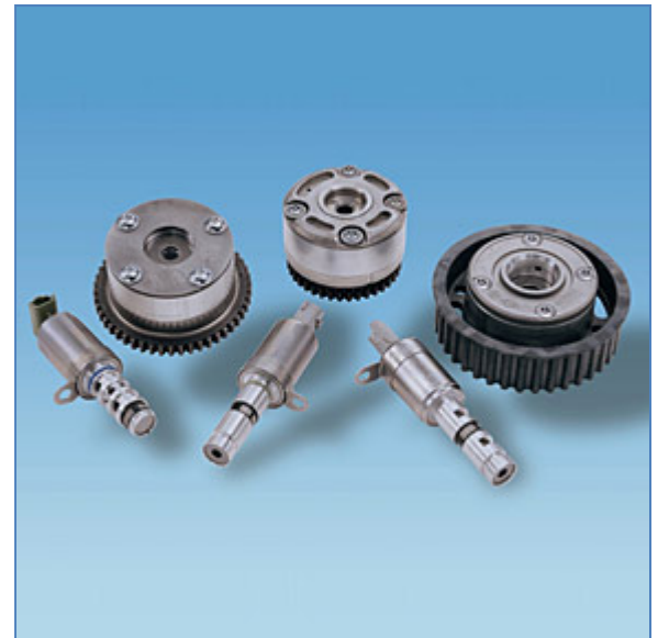
Delphi produces a wide variety of variable cam phasers and oil control valves to meet individual customer requirements.

As a global leader in engine management systems technology, Delphi can help manufacturers around the world meet emissions requirements, improve fuel economy and enhance performance. Delphi is a source for high value solutions and our systems approach is built into every product. Delphi's flexible engineering approach encourages collaboration. And, Delphi has a thorough understanding of automotive markets around the world and a global network of resources.