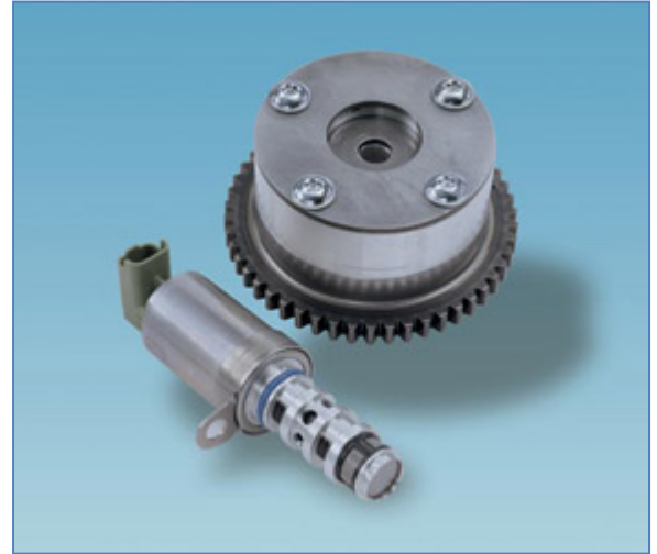
Delphi Variable Cam Phaser with Oil Control Valve

A Delphi Variable Cam Phaser can be applied to virtually any engine to help broaden the torque curve, increase peak power at high rpm, reduce hydrocarbon and NOx emissions and help increase fuel economy. VCP benefits are application-specific and are derived by increasing volumetric efficiency, reducing pumping losses and in-cylinder internal dilution control associated with varying the cam timing.