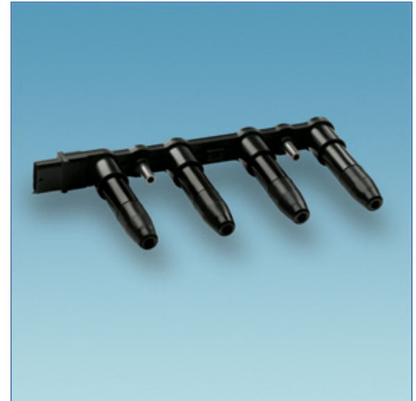
Delphi Pencil Coil Cassette

All design options are available in single coil, multi-coil packs, and cassette configurations.