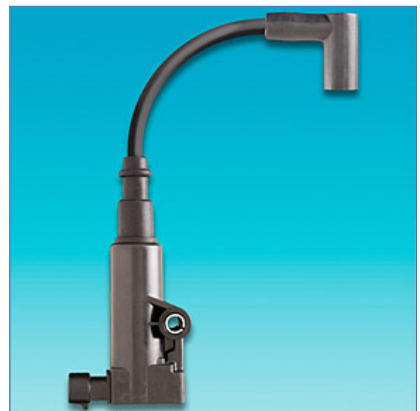
Delphi Ignition Coil for Small Engines