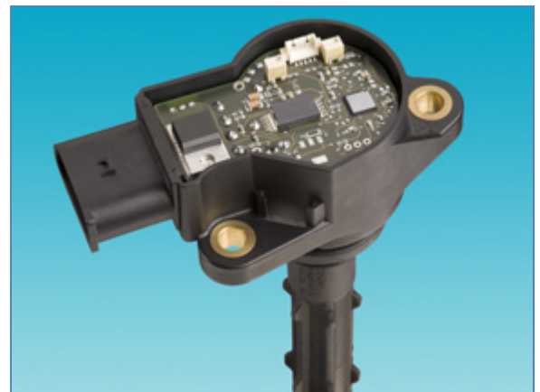
Delphi Plug Top Ignition Coil with Multi-Charge