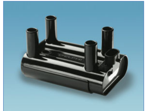
Delphi Waste Spark Pencil Coil Packs