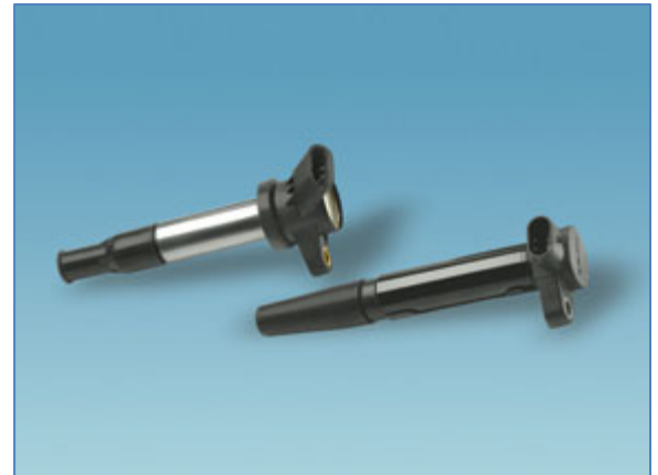
Delphi Pencil Coils