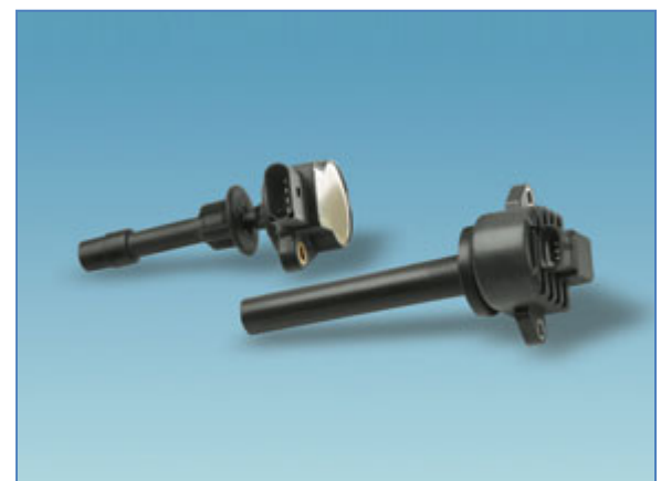
Delphi Plug Top Coils