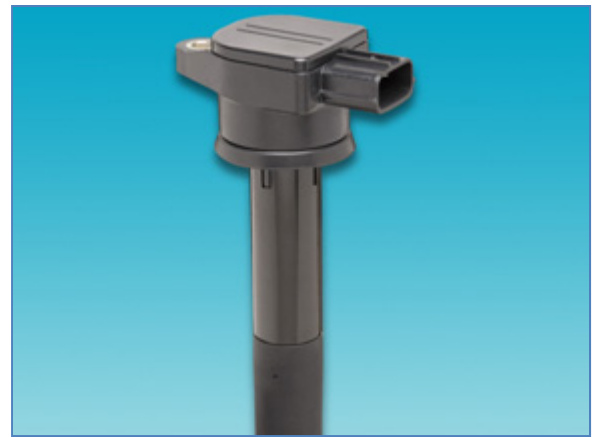
Delphi Ionized Current Sensing Ignition Subsystem

Delphi Multi-Charge features a coil-per-cylinder control that enables longer spark duration, increased spark energy and re-ignition in the event of combustion blow-out when liquid is present. It offers multiple opportunities for the initiation of robust combustion, improved geometric strength, and compensation of fuel spray variation. Delphi Multi-Charge is designed for spray guided GDi applications and other engines that use highly diluted fuel mixtures. Coil smart electronics are fully integrated and encapsulated.