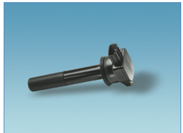
Delphi Gasoline Direct Injection (GDi) Pencil Coil